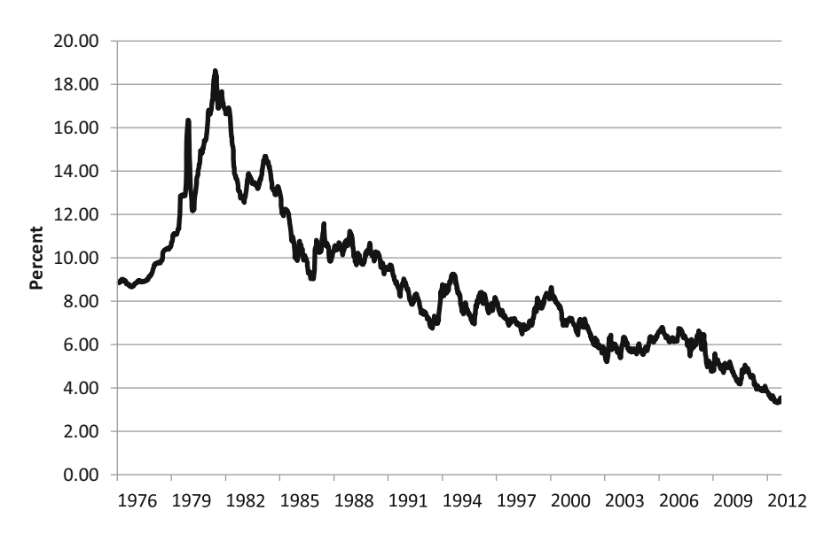
Fig. 1 Thirty-year fixed rate mortgage average in the United States.

the relatively poor US households have even further decreased relative to the richer US households.