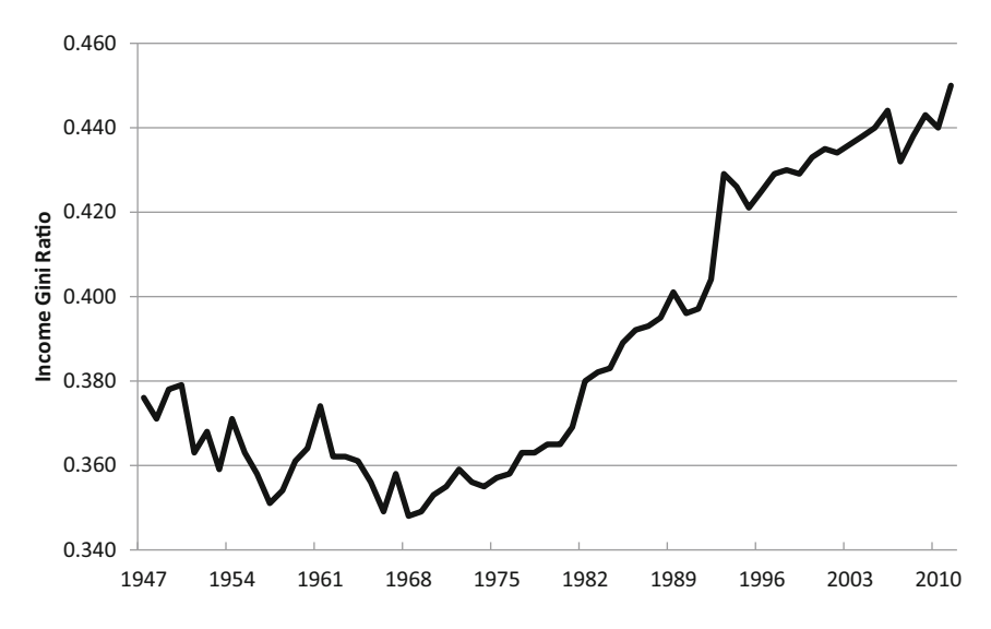
Fig. 2 Income Gini ratio of families by race of householder, All Races.

international division of labor and reduced labor productivity, which intensified again during the war years. A recovery followed only in the post-war years, this time with a more even income distribution.<sup>10</sup>